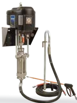
Hydra-Clean Air-Operated Wall-Mount

*Hose Reel is only included with cart mount package 24W474