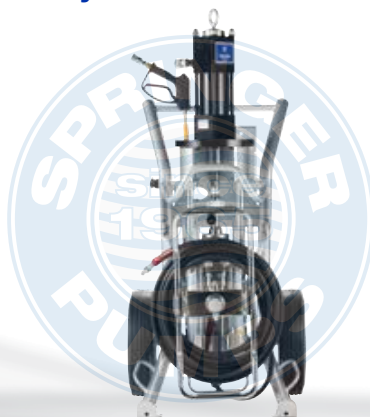
Hydra-Clean Hydraulic Cart-Mount* (Wall mount unit also available)

*Hose Reel is only included with cart mount package 24W474