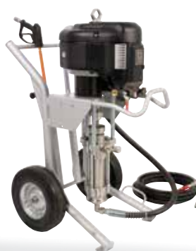
Hydra-Clean Air-Operated Cart-Mount