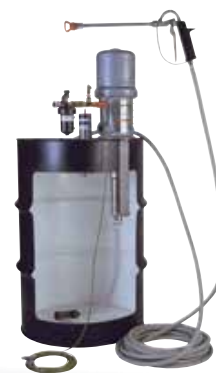
Hydra-Clean Air-Operated 10:1 Drum-Mount